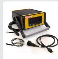
H29P Surface Display Pro' 6004-0079