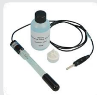
H124 Glass K-Series Reference Cell 6004-0013