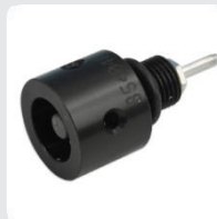
H6 Silver/Silver Chloride Half Cell 6004-0051