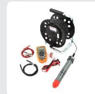
H50 Marine Survey Kit 60004-0044