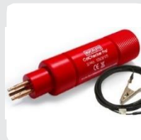
H3P CalChecker Pro' 6004-0080