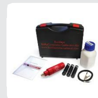
H28 BCM Calibration Kit 6004-0031