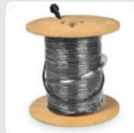
H35 BathyCorrometer to SDU Umbilical 50m 6004-0038