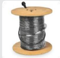
H30 BathyCorrometer to SDU Umbilical 100m 6004-0035